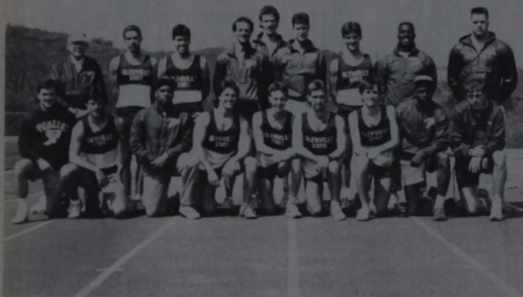
Pioneer Track Team