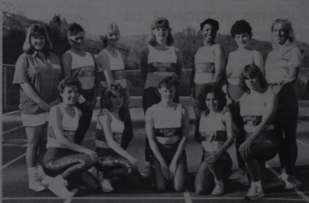
Lady Pioneer Track Team