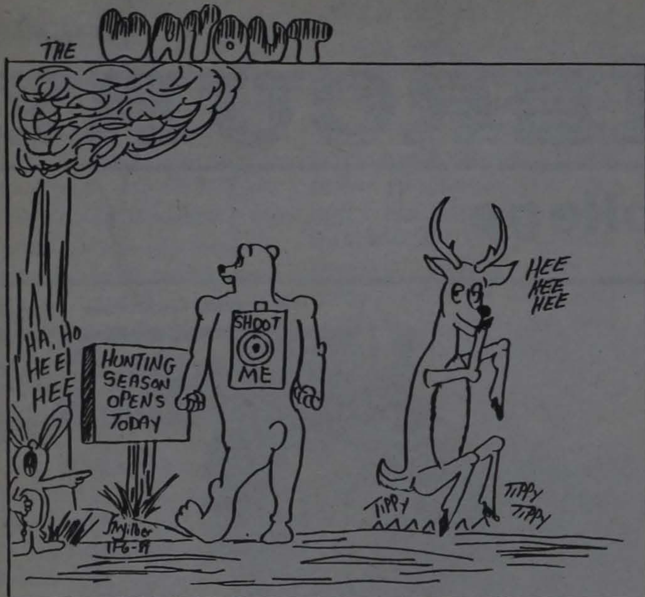
A "WAYOUT" LOOK AT: WILDLIFE PRACTICAL JOKES.