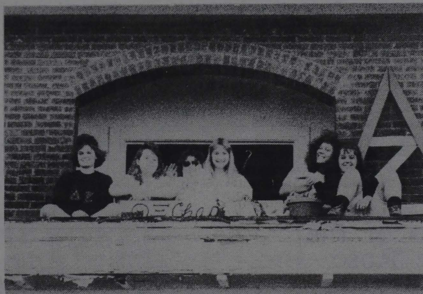
Sorority sisters enjoy the unseasonably warm temperatures at the Delta Zeta house.

The library has a new way for you to give them suggestions. Now, they've put a "suggestion box" at the bottom of the main staircase. This box is specifically for those who feel that the library needs improvement in some area.